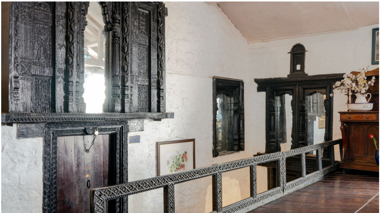
<u>Bungalow Jeolikote</u>has six wooden rooms with chic furniture and a fireplace to keep every guest warm during cold days and nights. Every room is decked with cozy furniture and an attached balcony with the best mountain views.